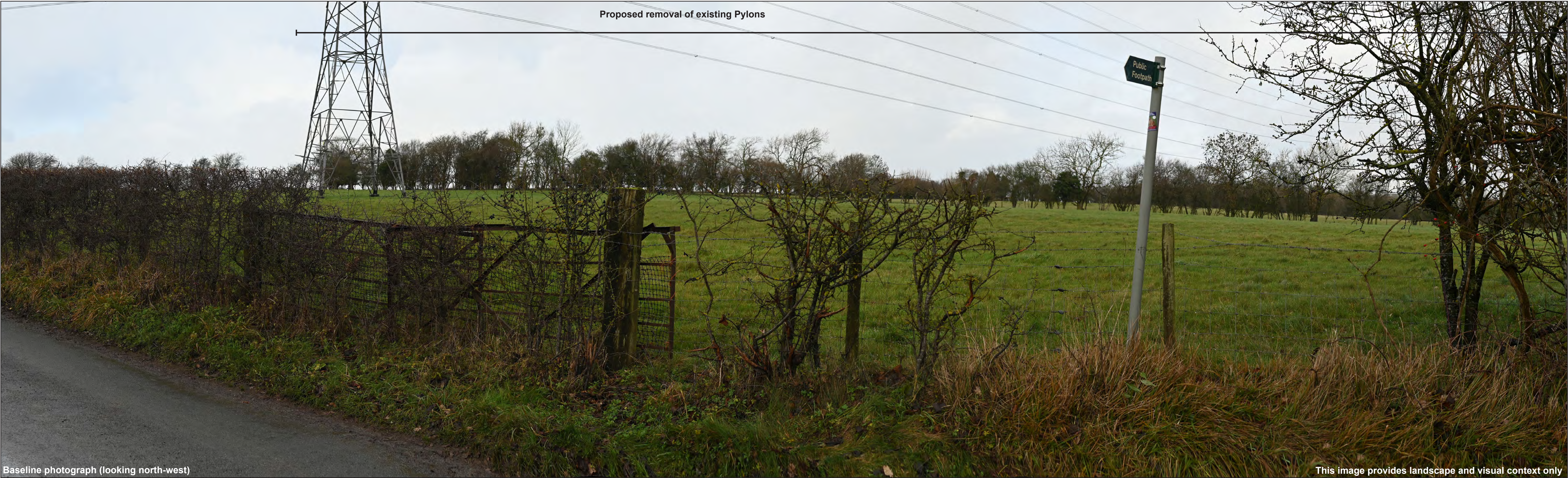
Baseline photograph (looking north-west)