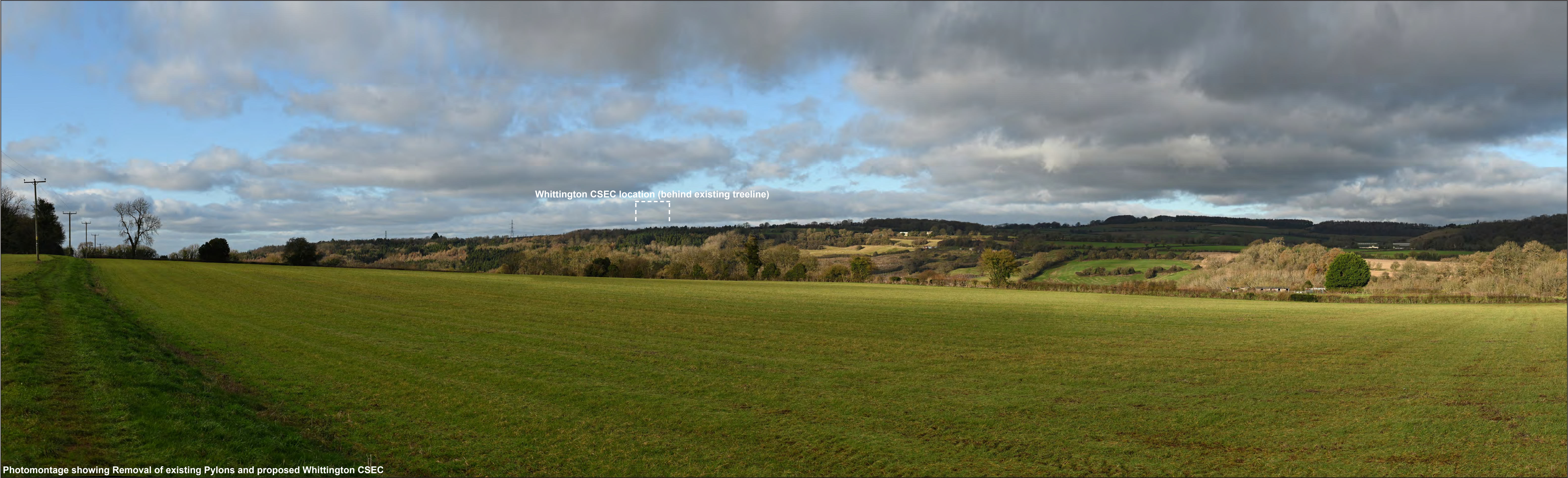
Photomontage showing Removal of existing Pylons and proposed Whittington CSEC