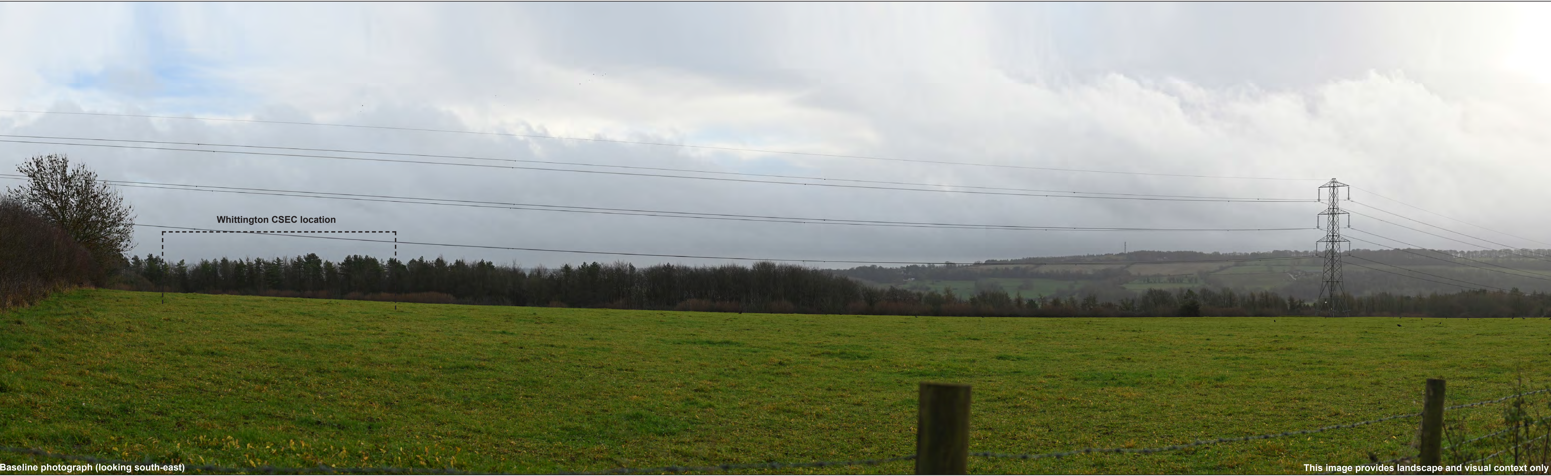
Baseline photograph (looking south-east)

© Crown copyright and database rights 2024. Ordnance Survey data. Licence number: 010031672. Contains public sector information licensed under the Open Government Licence v3.0. Aerial Imagery: Maxar, Microsoft