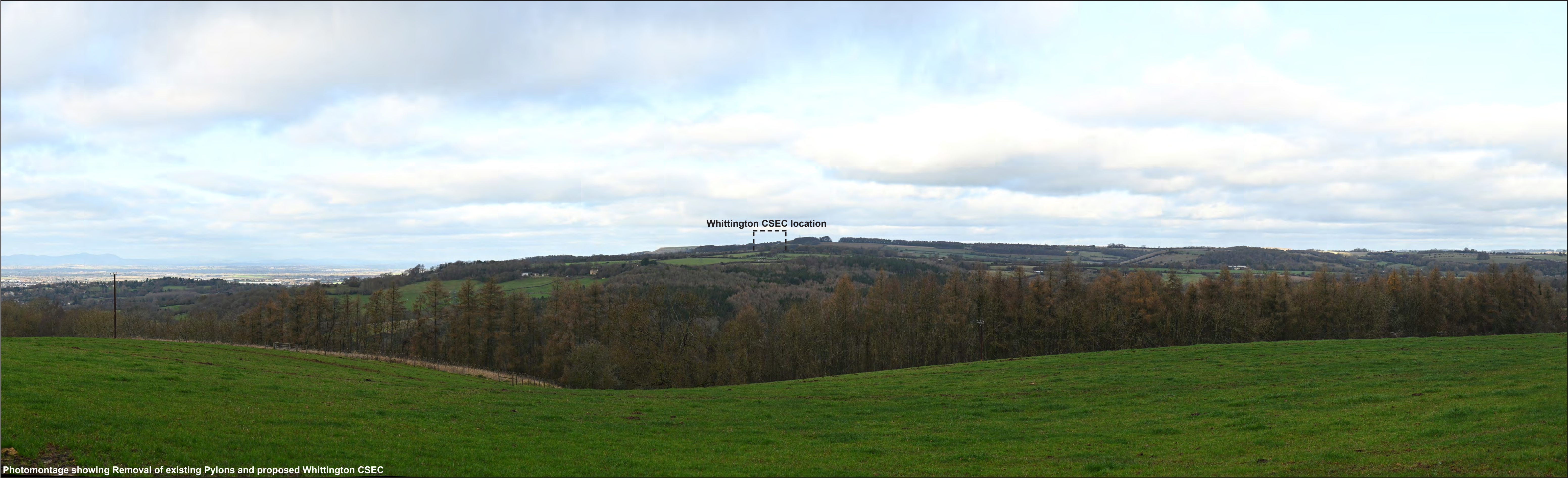
Photomontage showing Removal of existing Pylons and proposed Whittington CSEC