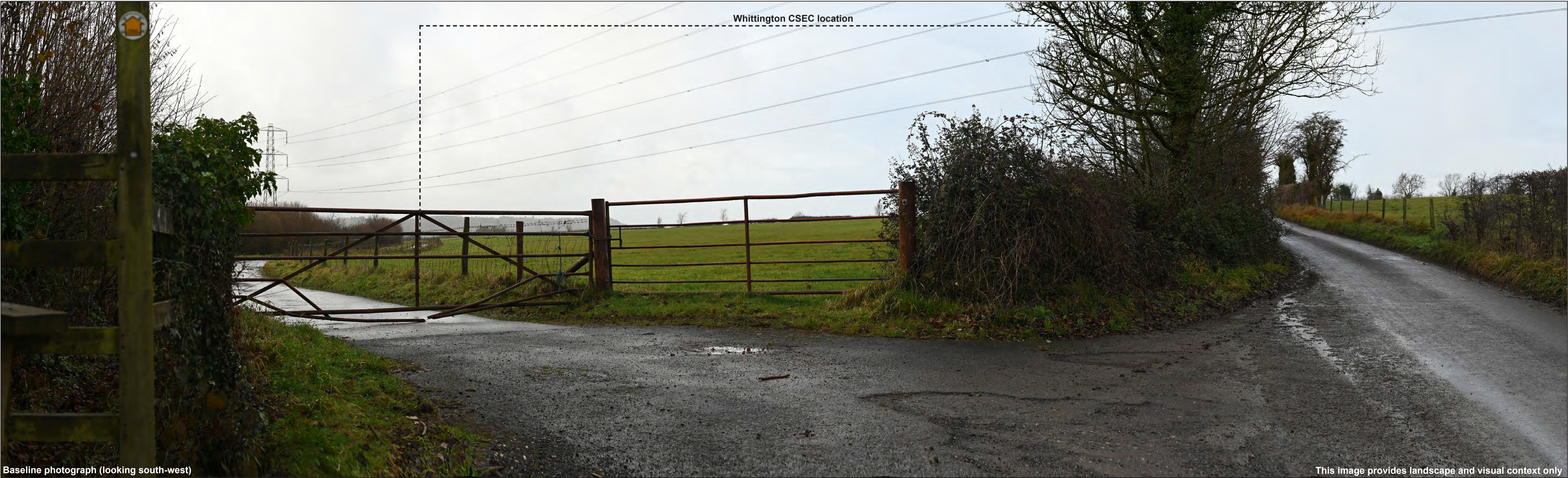
Baseline photograph (looking south-west)