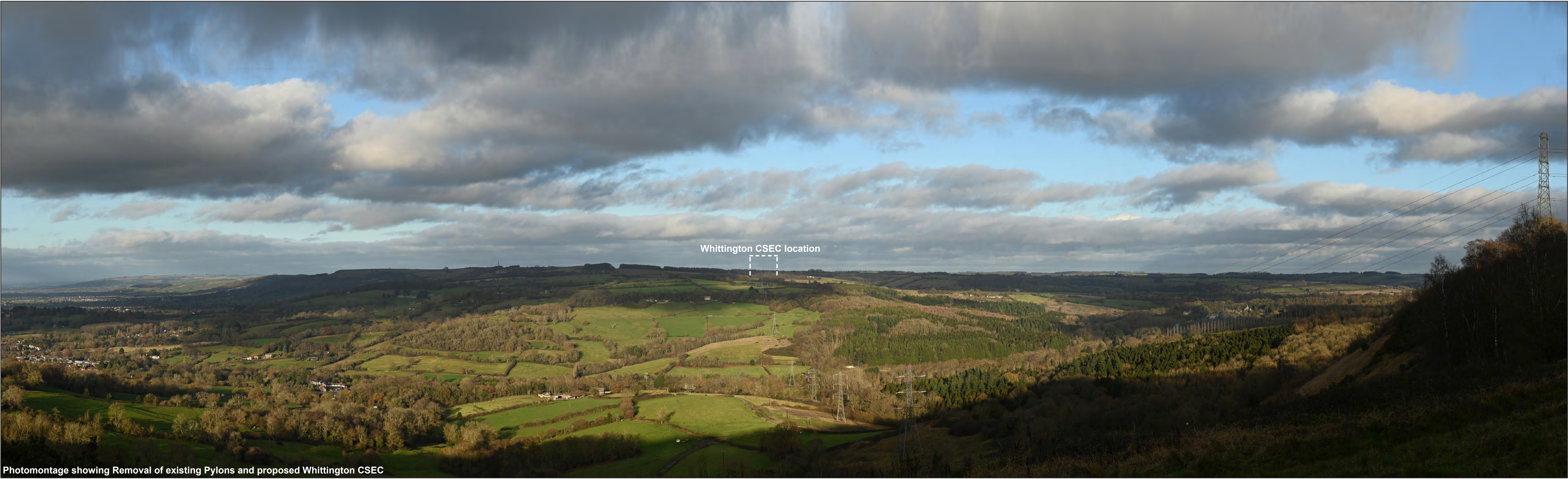
Photomontage showing Removal of existing Pylons and proposed Whittington CSEC

© Crown copyright and database rights 2024. Ordnance Survey data. Licence number: 010031675. Contains public sector information licensed under the Open Government Licence v3.0. Aerial Imagery: Maxar, Microsoft